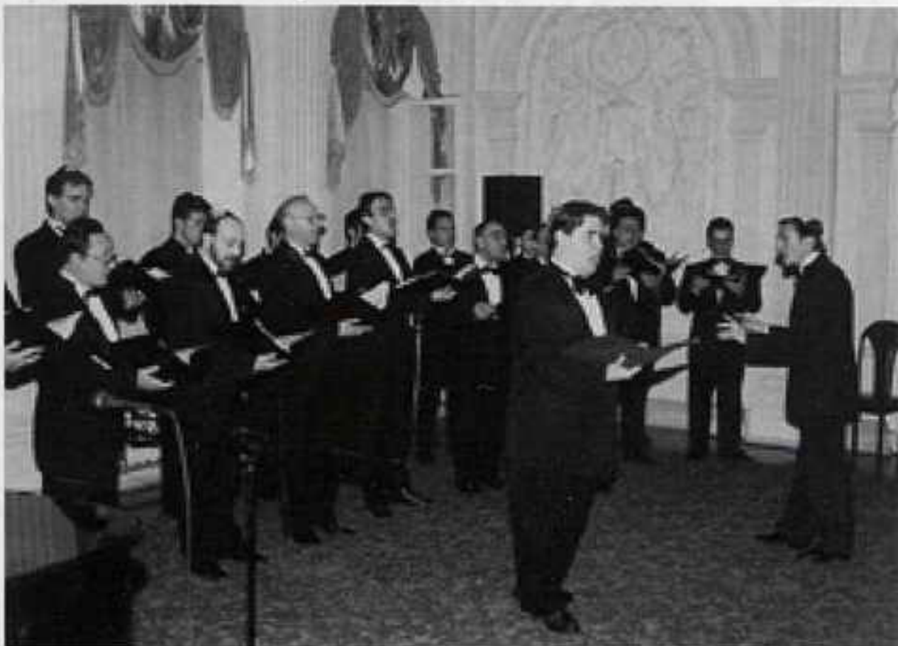
Private pre-concert performance for the Danish royal family

Complimentary tickets are available at the Center’s front desk.