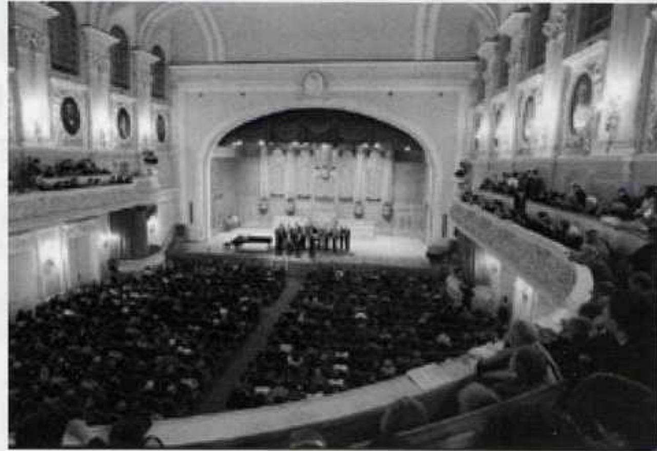
The Choir performs in the Tchaikovsky Hall in Moscow.

Among the Choir’s repertoire are compositions of world classics and songs of people of the world. From its inception, the Choir has sought to revitalize the Jewish choral and vocal music arts, based upon the deep roots and ancient traditions, not only of the Jewish community, but also, professional classical Russian